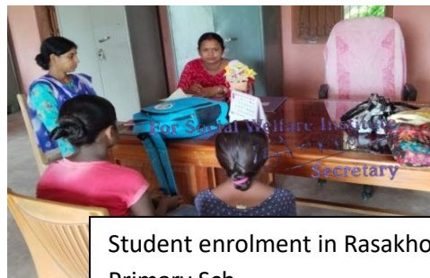
Student enrolment in Rasakhov Primary Sch.

252 students are enrolled in 12 tuition centre of Rasakhowa and Rampur Gram Panchayats of Uttar Dinajpur ditrict. They are getting coaching according to govt. books and syllabus. These dropout students are prepared for enrollment in the Govt. Primary/ High Schools. 92 school dropout children have been admitted to Govt. school through the efforts of the tuition centers. These children belong to very poor family. The parent couldn't afford to re-enroll the children after dropout of school during covid 19.