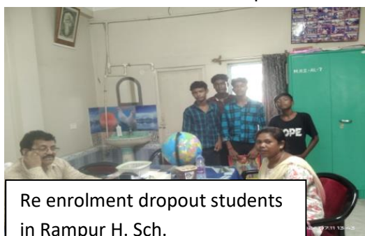
Re enrolment dropout students in Rampur H. Sch.

Name list of the students those who have been re-enrolled in different schools.